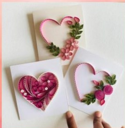
Quilled Paper Wall hangings or cards

Register by emailing lhumke@draschools.org by Jan. 23rd