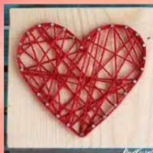
String art Wall hanging or cards